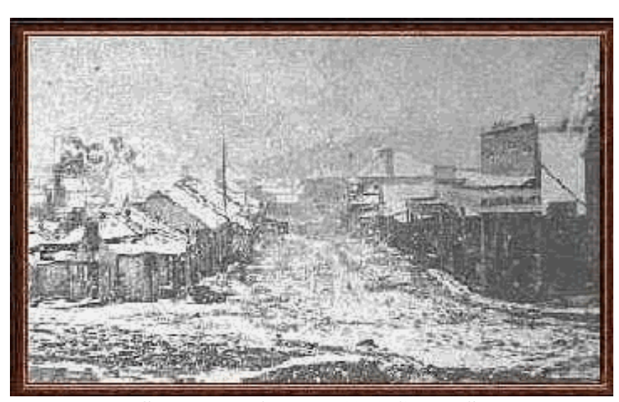
Snowstorm October 1872 Clarke St

October 2004 certainly seems more spring like than it must have done 132 years ago.