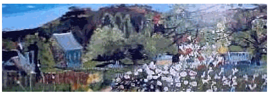
'Home' by Gria Shead