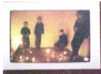
Catholic Church Candle Installation

This community arts project has been made possible by the Commonwealth Government's regional arts program, the Regional Arts Fund, which gives all Australians, wherever they live, better access to opportunities to practice and experience the arts.