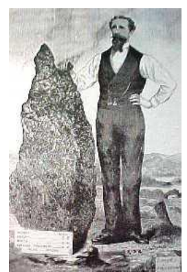
Holtermann Specimen image from Life Drops lable

The previous photo seems to caste doubt on the old concept that Holtermann posed in absentia with the specimen superimposed later, for the more renowned image. However here is Holtermann clearly beside the freshly removed wonder. It seems more likely that the posed photo concept was for the advertisement for his 'life drops' he later marketed, well after the Specimen was crushed.