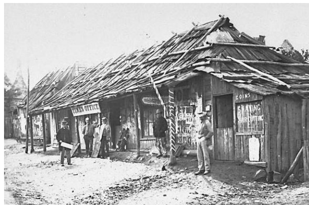
The Time Office, Hill End, taken from the Holtermann Collection held in the State Library of NSW.

There are only 7 issues in existence, ranging from 1871 to 1875. These are available at the State Library of NSW on microfilm. It is surprising how many local names are mentioned, either in articles or in advertisements. You never know, your ancestor may have been amongst them. In many instances it gives their occupation or address and so helps to put a little more flesh on the bones, so to speak.