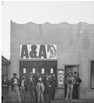
Office of the American & Australasian Photographic Co

At last years gathering there was some talk of trying to co ordinate a photo project. There must be so many old photos in people's collections that others would be interested in seeing. With the digital facilities available to us these days it is so much easier to share them around.