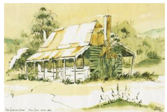
The English Home by Sidney Neighbour (1977)

Here we were, in a primitive cottage built in the 1870s, surrounded by the artefacts & furniture of the period and yet still able to access the latest electronic media of the 21st century... mindblowing.