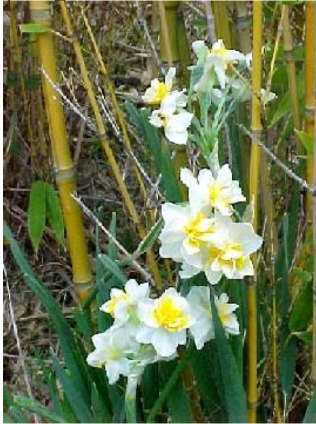
Daffodils first bloom August 2006