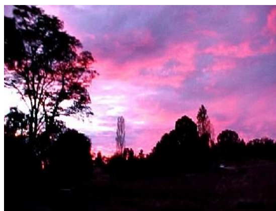
The Dawn of Spring is upon us

Email contributions- progress@hillend.org or hard copy via Stamper Battery c/o Hill End PO