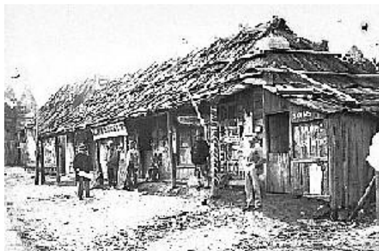
The Bark roofed Times office, Clarke St