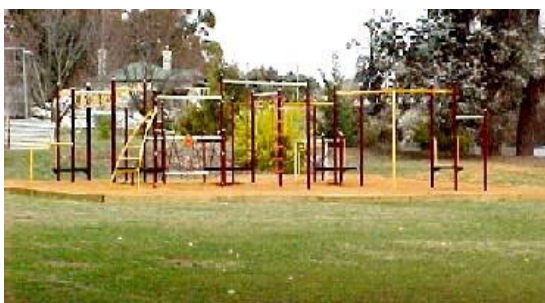
School's new playground

The second, (which was a HETPA grant funded initiative), is aimed at a younger age group and situated in Lyle Park. Ed.