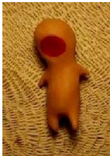
Beth Norling-animation figure