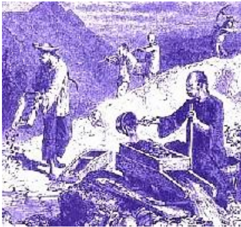
Chinese Miners 1866