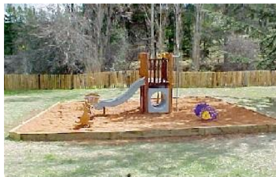
Lyle Park playground