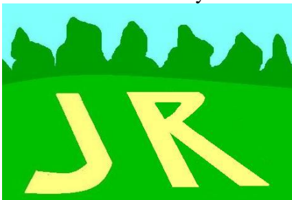
Initialed hillside. Medium-hay on grass.

Continuing our hunt for historic local graffiti, this edition was distracted by a more recent set of initials set in the landscape. As the Hill End road climbs up from Sally's Flat, in the paddock to the right, the feed put out for the sheep there was done in a most creative manner, the giant initials 'JR' were spread across the hillside, perfectly written with the strewn hay. Ed.