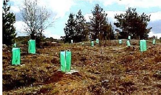
Chinese Lanterns dot the landscape.

sculpture in town itself! However it was in reality a Parks environmental reclamation project, removing the dreaded pine tree and replacing them with native trees, she-oaks and gums. Ed.