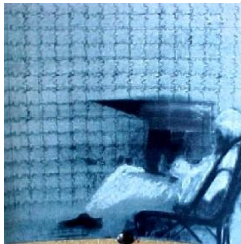
Joanne Searle-sound wave sketch

“I came to Hill End to do preliminary drawings before 2 dimensional works in clay”. Joanne is a ceramicist from Canberra. Her work involved recording sounds and a computer program to provide a 2 dimensional interpretation. “It’s called a sound wave which makes patterns and I reconstruct these patterns into a drawing. The background of the illustration below is derived in this way.