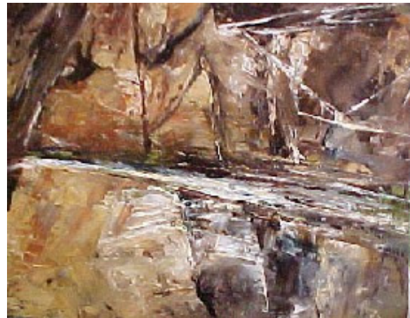
Maurice Orr-Creek Rocks