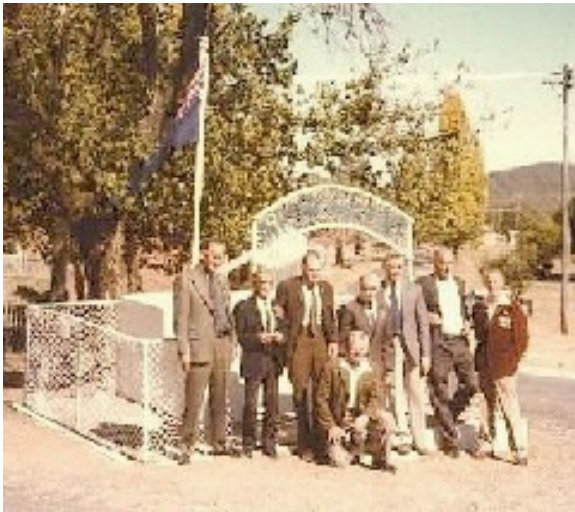
Easter Gathering 1981-Hill End War Memorial