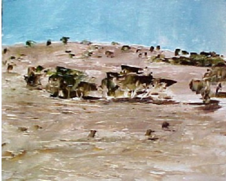
Turondale Summer-Maurice Orr