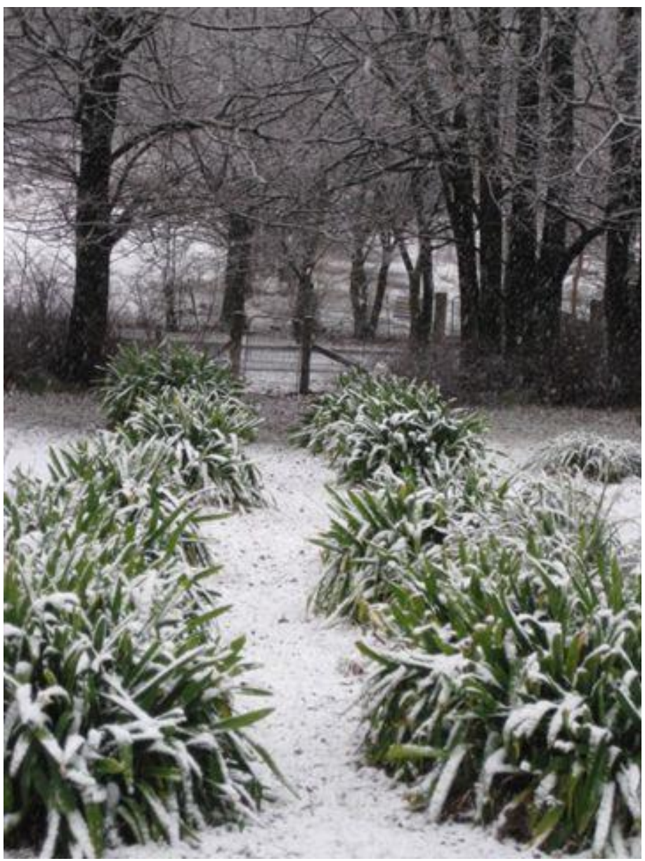
July Snow- Maggy Todd