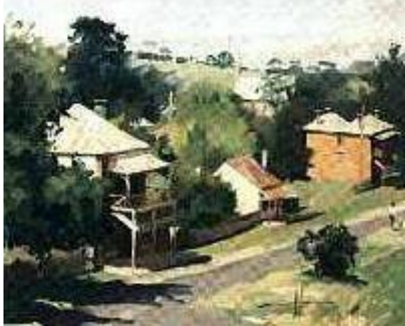
Graeme Inson- Clarke St 1996