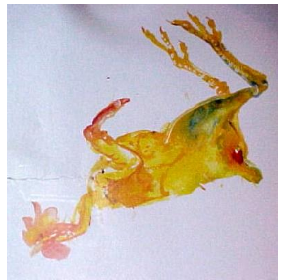
Luke Sciberras-Plucked Cock

each night to capture the culprit. The rest of her lost flock has been interred into the Deepfreeze, waiting to render the ultimate service. RC